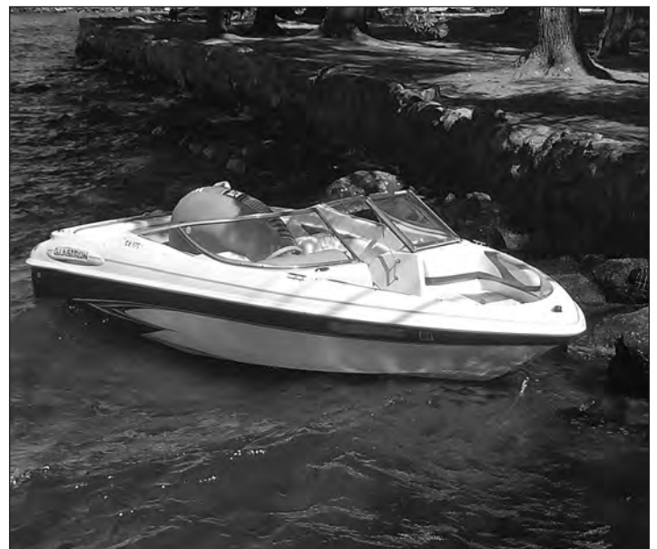
A boat from the unregulated mooring field near the Town Swim Beach in Elkins, seperated from its mooring and up against the rocks.