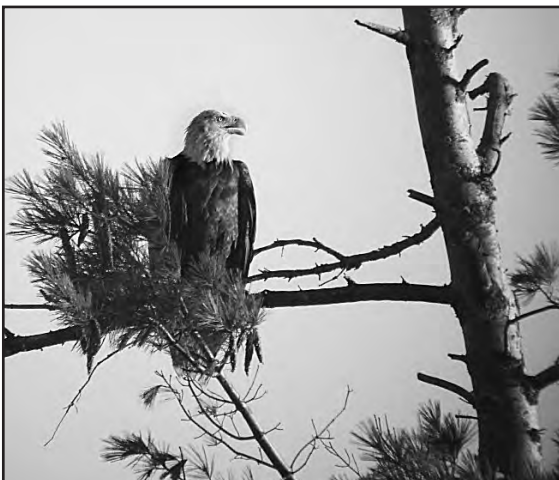
Left: Eagle on Blueberry Island, Pleasant Lake.

The Town of New London Planning Administration is a good resource. Contact Town Planner Adam Ricker at 526-1247 for applications and permits.